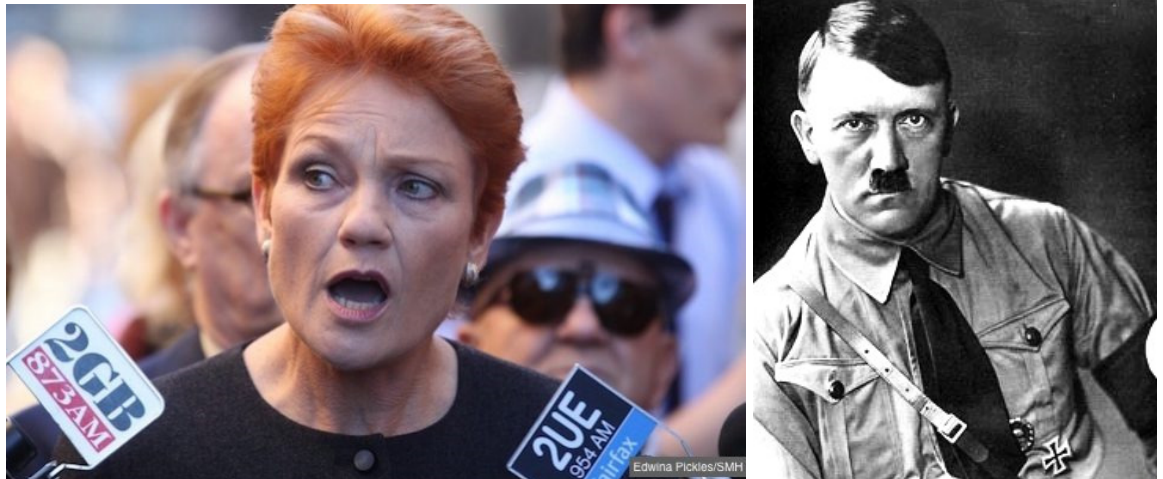
One of these is a highly inflammatory and divisive harbinger of hate looking to encourage a nation to turn on and reject inferior races (autistics, off you go too!) and eradicate them once and for all. The other one is Adolf Hitler .