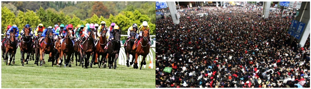
L – There is a plethora of live chances in the 'NCC Oktoberfest in July Stakes' R – Folks will be lining up in rows to grab a ticket for this pulsating race for the Ages.

One thing is for sure and certain – sheer entertainment and fun will be clear winners on this night.