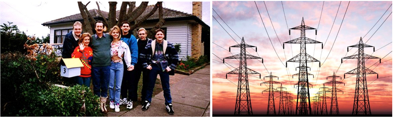
L – The Castle – life imitating art, or is it the other way round? R – Power lines. A sage reminder to all of us of man's ability to generate electricity.