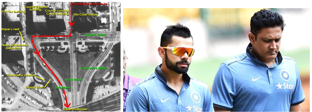
Left – An aerial map of the JFK motorcade route (in blood red). R – 'United we stand?' Yeah no.

Some say there were as many as six different 'shooting teams' located around Dealey Plaza, to ensure the 'job' was done properly. One curious aspect of the case is that, before JFK's Lincoln slowed down (considerably) to turn about 105 degrees into Elm Street from Houston (" we have a problem ") Street, Houston Street was jam-packed with people 7-10 rows back, but in Elm Street, there was suddenly only a smattering of people there in the much more open Dealey Plaza area. It was if this area was being kept less populated for some reason. Wonder what that could have been?